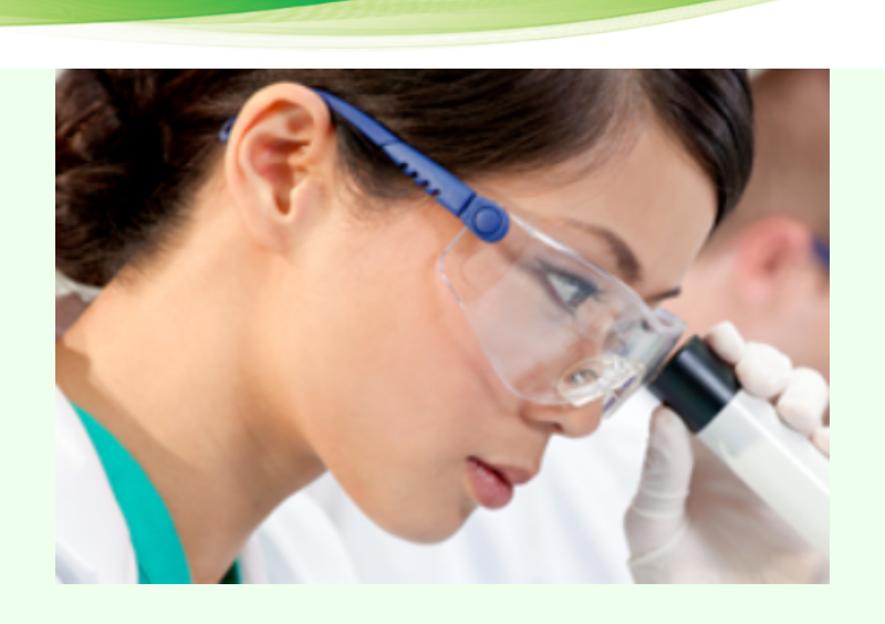
Expanding the Boundaries of Medicine